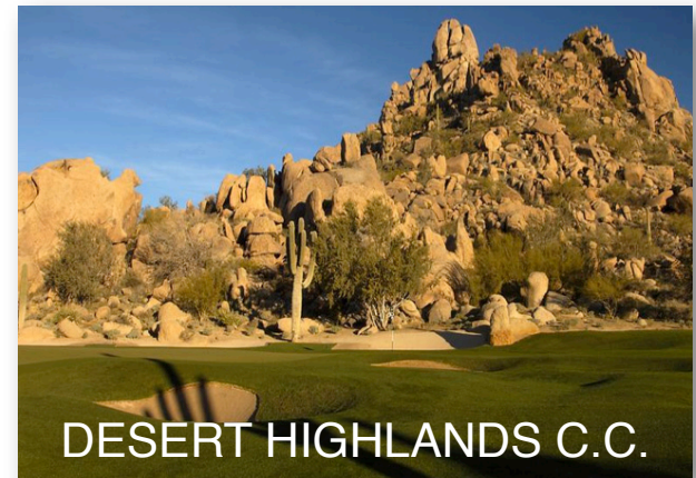
DESERT HIGHLANDS C.C.

Eleventh Annual Golf for Charity It's a Hole In One For Charity