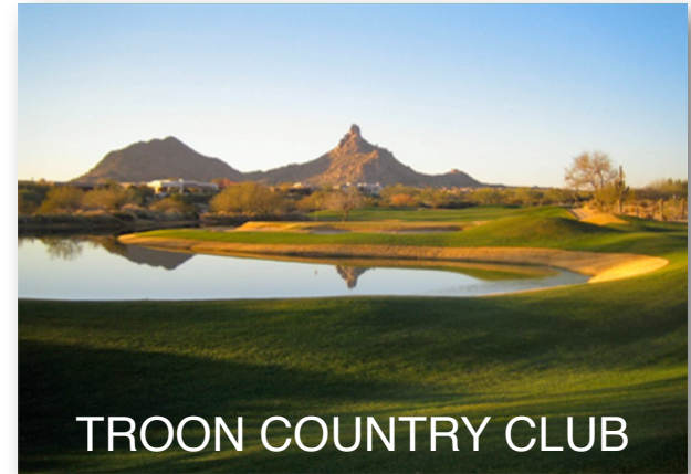
TROON COUNTRY CLUB